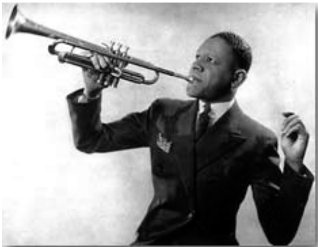
Henry "Red" Allen

Red Allen then reinvented himself forming a sextet of his own which achieved great popularity in New York at clubs like Kelly's Stable and Café Society. This group, with occasional personnel changes, remained together until the early 1950s. His trum-