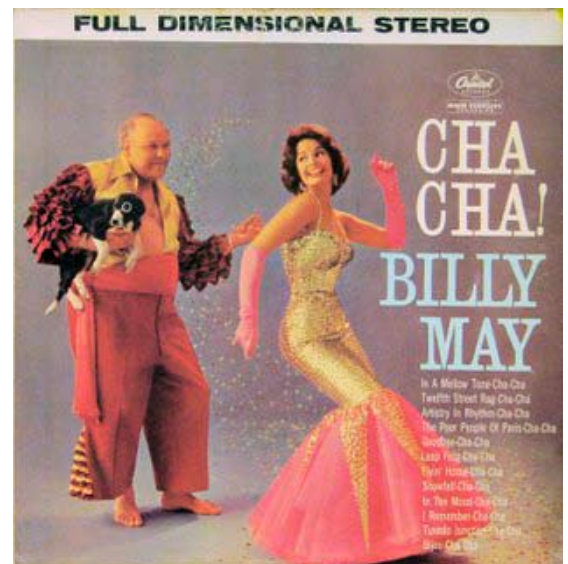
Billy's sense of humor shines for CHA CHA!

He contributed to the advancement of music nationally and internationally since he joined the Charley Barnet Band in 1938, immediately distinguishing himself as a music innovator. For 66 of his 87 years he contributed a prodigious amount of work to the acclaim of musicians and the listening public worldwide. He died on January 21, 2004. □