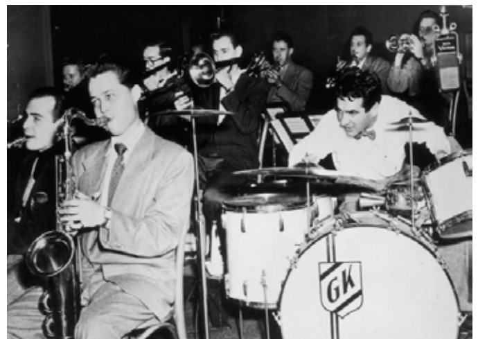
Gene Krupa