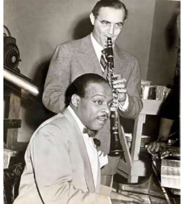
Benny Goodman with Count Basie