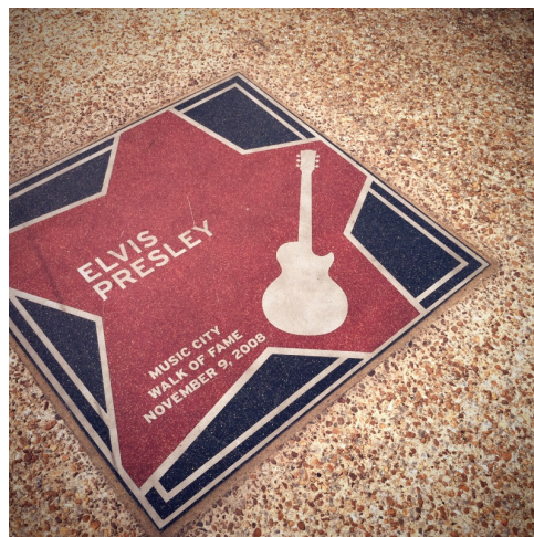
http://bit.ly/pyOVyF (attribution is “Music City Walk of Fame, Nashville. By vasta”)

The artistic merits of these decisions aside, they undoubtedly added a new dimension to Elvis's appeal and helped entrench his popular presence. They also seem to have appeared in conjunction