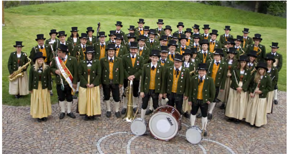
Prutz Town Band.

The band is over 300 years old! It can trace its origin back to 1694, during the era when small groups of wind and string musicians were often formed to play in towns - - mostly for ceremonial functions -- and in the church.